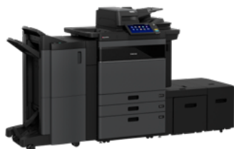
e-STUDIO9029A e-STUDIO6529A e-STUDIO7529A