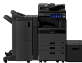
e-STUDIO6528A e-STUDIO3528A e-STUDIO5528A e-STUDIO3028A e-STUDIO4528A e-STUDIO2528A