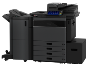
e-STUDIO7527AC e-STUDIO6527AC e-STUDIO6526AC