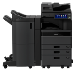
e-STUDIO6525AC e-STUDIO3525AC e-STUDIO5525AC e-STUDIO3025AC e-STUDIO4525AC e-STUDIO2525AC